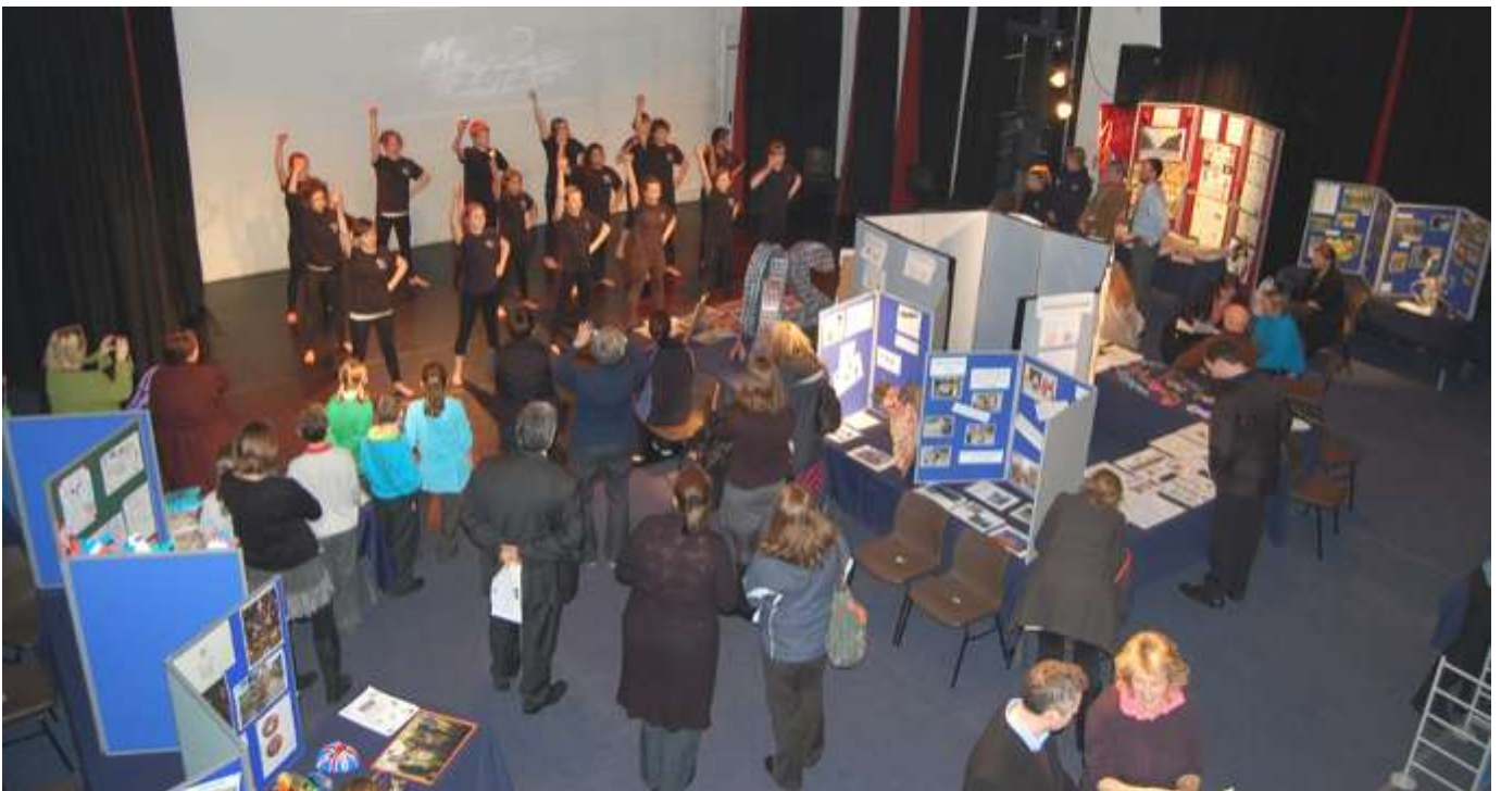
Photos from our January Marker Event